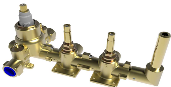
Immagine Prodotto - Product Image

Встраиваемые части термостатического смесителя Tess 2 выхода, с подключением к водоснабжению, соединение на 1/2" - Латунь неочищенная